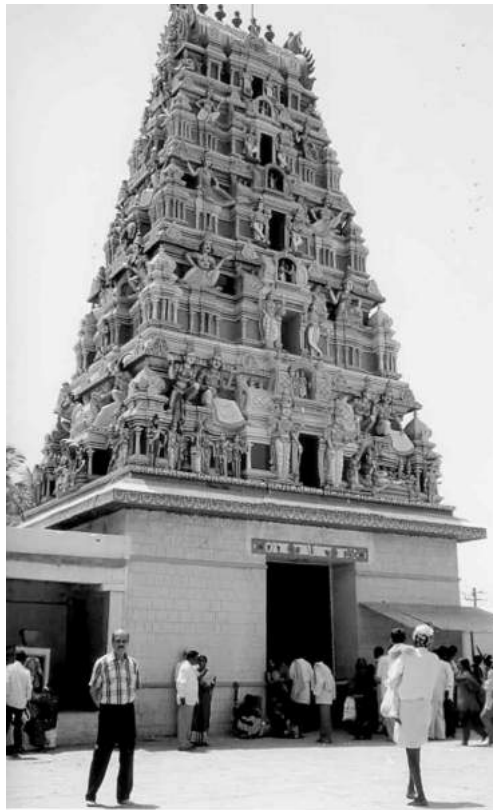
" Sri Prasanna Venkateshwara Temple "