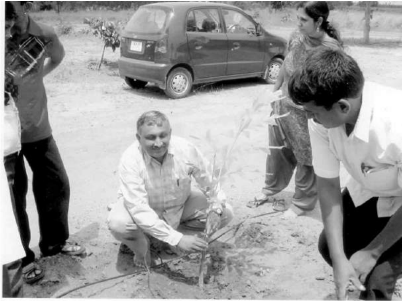
Planting Sapling in Bagalur Project