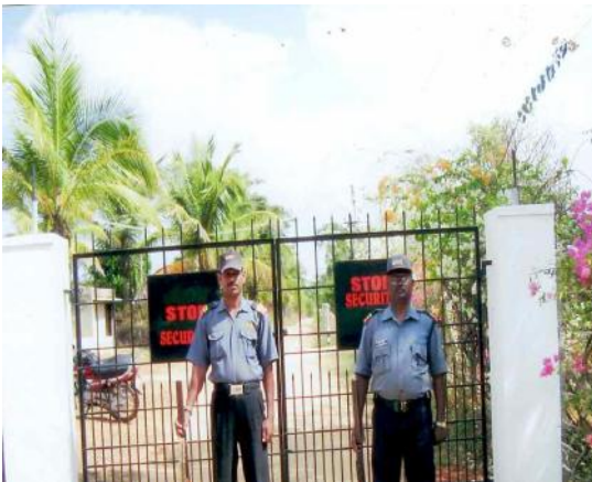
Gun Men in Action

All our efforts are to make you & your property safe.