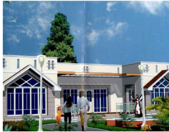
Elevation of the Cottage